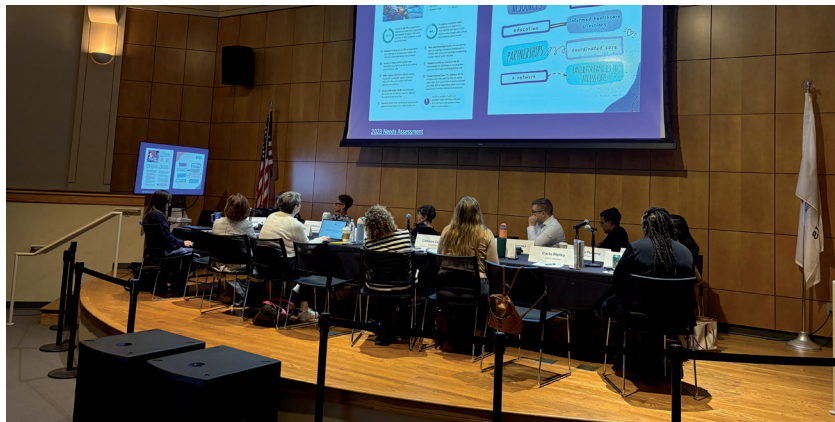
ICMHP members gather in person for their October 2025 meeting in Naperville, IL.

Goal Four: Goal Four: Grow, retain, diversify, and support the child-serving workforce, with special emphasis on professional development around child and family mental health and wellness, and services and supports to address needs.