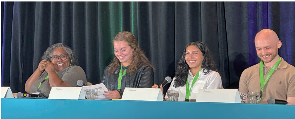
ICMHP Youth Council members and staff present on a panel in September, 2025.

The work of the ICMHP Youth Council is strong and serves as a model elevating youth voice, for advocating for changes in youth mental health in the state of Illinois, and for cultivating the knowledge and skills for the next generation of mental health advocates. Youth empowerment as a driver of change was elevated throughout the process during 2025. Whether youth training to serve as navigators or youth leadership to connect needs in school spaces to community resources, the gap in current practice was elucidated. The ICMHP Youth Council can continue to serve as a model of youth mental health advocacy, mentored and coached by community partners and content experts to develop their perspectives into viable platforms. IDPH will continue to partner with CCR and the 2025 youth council to reflect on these recommendations and offer potential pathways in the coming year.