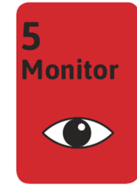
Monitor the student —never leave them alone.