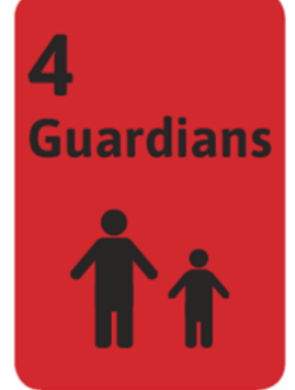
Call the student's parent or guardian.