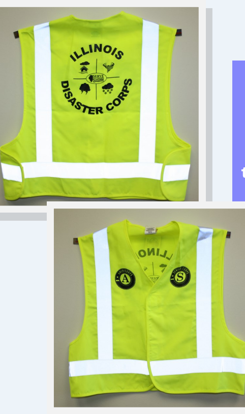
If you are ever at the scene of a disaster in Illinois, you might see this badge or these vests at the Volunteer Reception Center know that you are in good hands!

When disaster strikes, many areas see an influx in volunteers coming to help clean up the aftermath. Although this is wonderful, it can do more harm than good unless the volunteer are managed properly. By continuing to strengthen the presence of Illinois Disaster Corps with support from National Service members we have set a strong foundation to help communities get back on their feet.