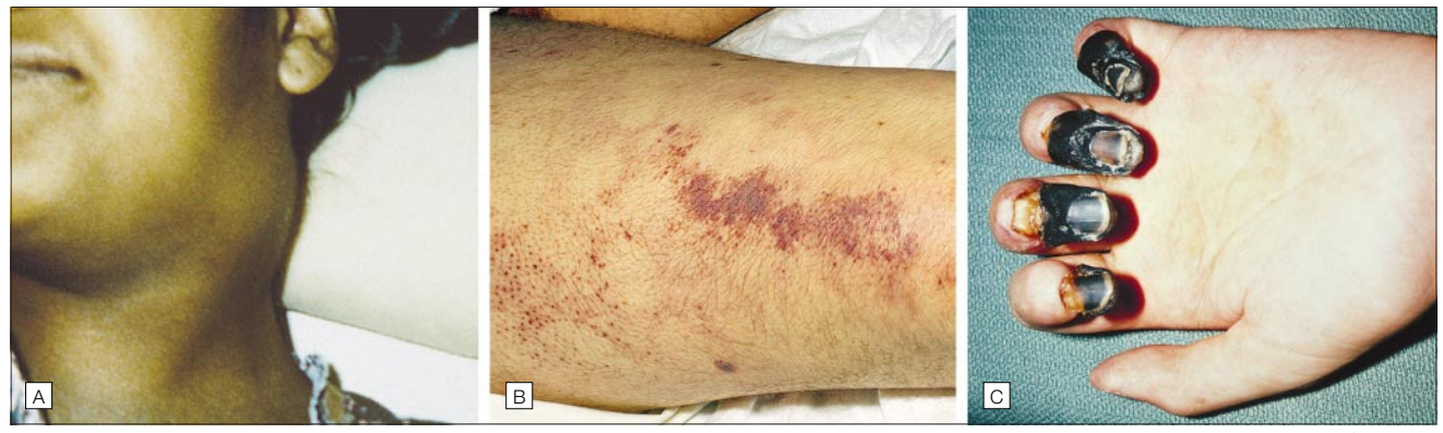
A, Cervical bubo in patient with bubonic plague; B, petechial and ecchymotic bleeding into the skin in patient with septicemic plague; and C, gangrene of the digits during the recovery phase of illness of patient shown in B. In plague following the use of a biological weapon, presence of cervical bubo is rare; purpuric skin lesions and necrotic digits occur only in advanced disease and would not be helpful in diagnosing the disease in the early stages of illness when antibiotic treatment can be life-saving. Figures from Centers for Disease Control and Prevention, Division of Vector-Borne Infectious Diseases, Fort Collins, Colo.