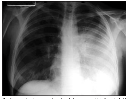
Radiograph shows extensive lobar consolidation in left lower and left middle lung fields.

intestinal symptoms including nausea, vomiting, abdominal pain, and diarrhea. Diagnosis and treatment were delayed more than 24 hours after symptom onset in both patients, both of whom died.<sup>24,25</sup>