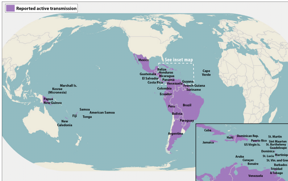
Figure 1. Zika virus spread worldwide and in the Americas .