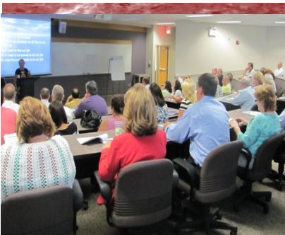
Environmental cleaning breakout session

Attendees completed a workshop evaluation. Responses to two questions are highlighted below.