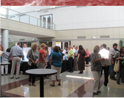
Attendees at NIU Naperville browse vendor exhibits during break

Infection Preventionists from six hospitals that participated in the Illinois Clostridium difficile Prevention Collaborative discussed the following points: